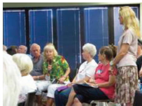
Top/Above: Rap Session Discussion

The Sarasota Chapter loves its volunteers – us helping each other – who spend a few hours here or