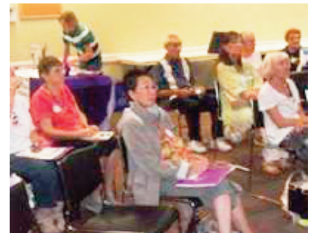
Above: June Rap Session

That topic led into movie captions and it was explained that all Regal theaters have the Sony caption glasses and that the AMC Theaters have a caption