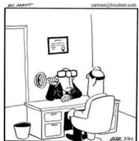
"I said, it's the only hearing aid covered by your insurance."

Most of us have failed with attempts to file insurance claims or Medicare reimbursement for hearing aids or related assistive devices. This cartoon below is, unfortunately, the result we so often find.